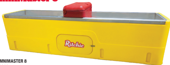
OMNIMASTER 8 18860