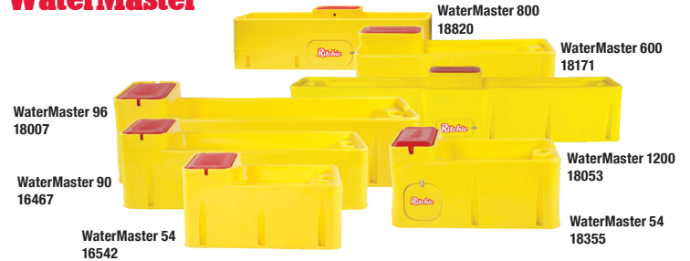
WaterMaster 96 18007