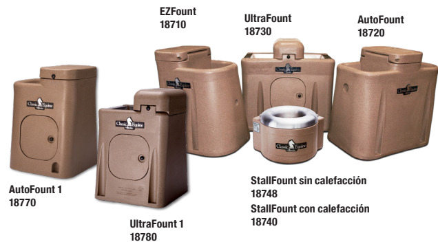
AutoFount 1 18770