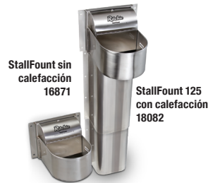
StallFount sin calefacción 16871