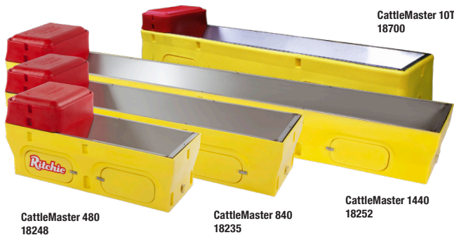
CattleMaster 480 18248