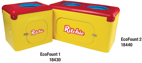
EcoFount 1 18430