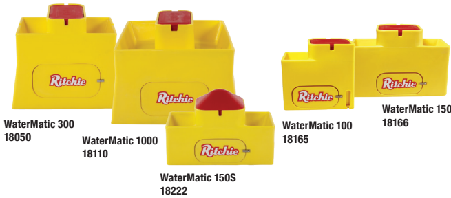
WaterMatic 300 18050